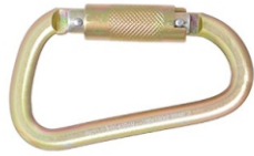
Steel Quarter Turn Locking Karabiner