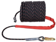
Kernmantle Rope Anchorage Line