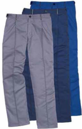
Kolding & Nord