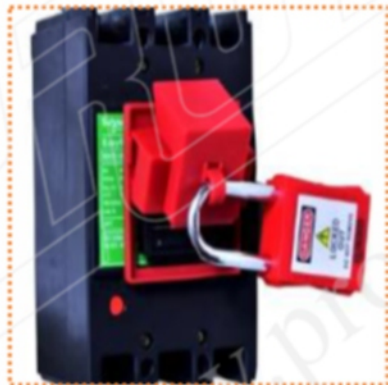
Snap on Circuit Breaker Small (LS-BR42)