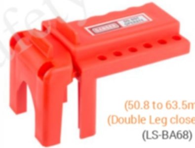
(50.8 to 63.5mm) (Double Leg close back) (LS-BA68)