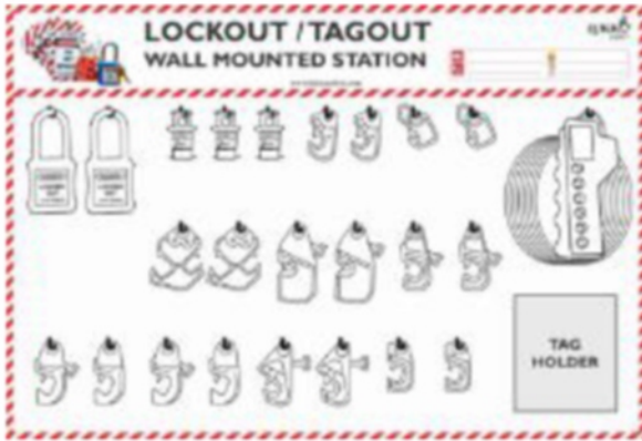
Open Lockout Tagout Circuit Breaker & Valve Station (LS-BR50)