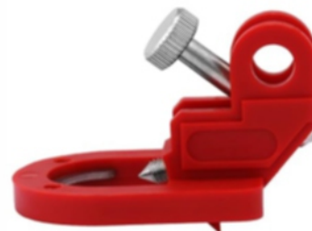
MCB lockout with foldable screw (LS-BR47)