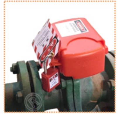
Adjustable Flange Ball Valve (LS-BA73)