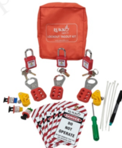
Medium Electrical Lockout Tagout Kit (LS-K61)