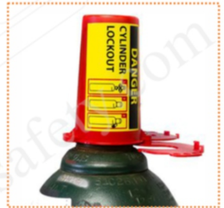
3 IN 1 Cylinder Lockout (LS-PL89)