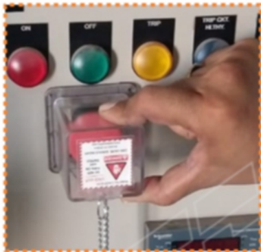
Square Small connected with chain, (LS-EP52)