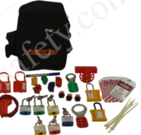
LOTO Circuit Breaker Kit (LS-P204)