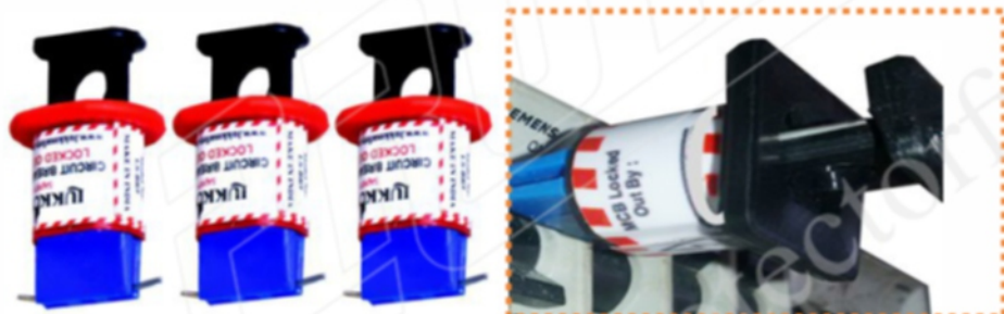
MCB Lockout Pin WIDE Pattern (SET OF 3 PIECES) (LS-BR11)