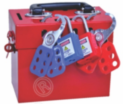
Small Group OSHA LOTO Box Padlock & Hasp Kit (LS-G09)