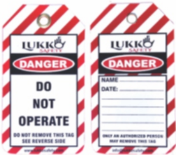
Do Not Operate (LS-T46)