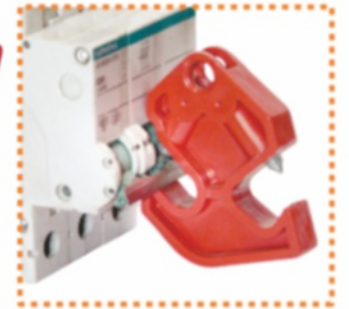
Dual Sided Circuit Breaker (LS-BR26)