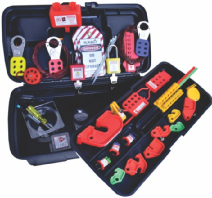
Electrical Tool Box Kit (LS-S34)