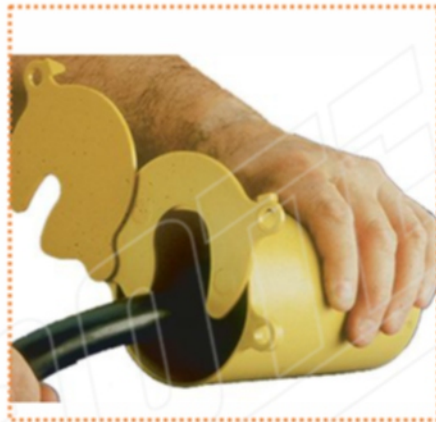
3 IN 1 Electrical LOCKOUT (LS-PL80)