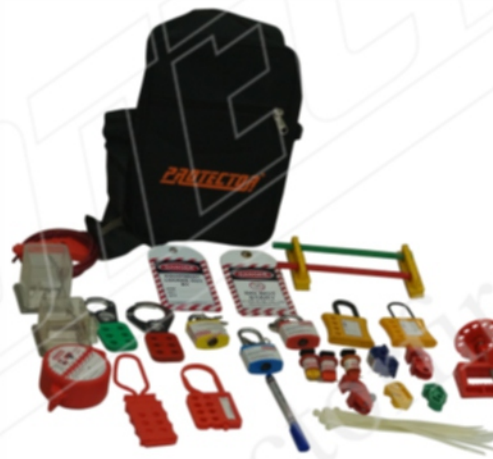
LOTO Electrical Kit (LS-P205)