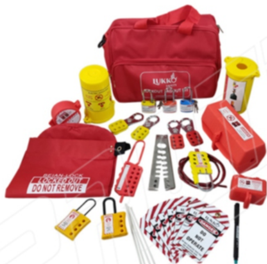
Electrical & Pneumatic Loto Kit (LS-K54)