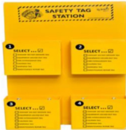
Safety Tag Station With 14" x 9" (LS-T88)