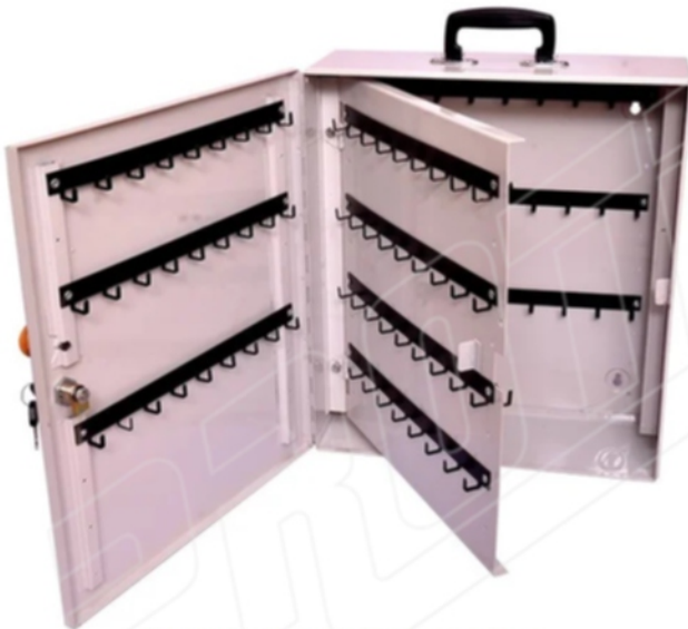
Double Door Key & Padlock Lockout Cabinet 15"x 6"x 18" (LS-S45)