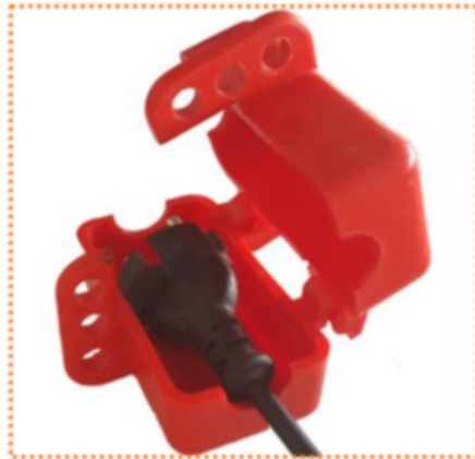
Small Plug Lockout, 4 locking holes (LS-PL78)