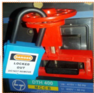
Large Handle Circuit Breaker Lockout (LS-BR30)