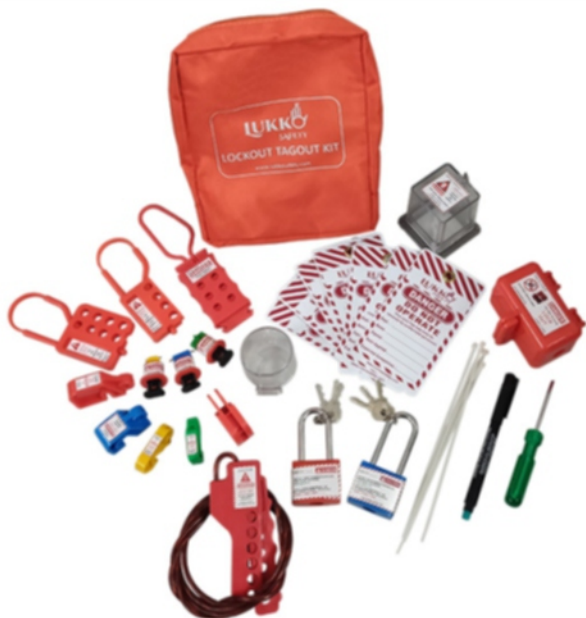
Lockout Tagout Electrical Power Pouch Kit (LS-K60)