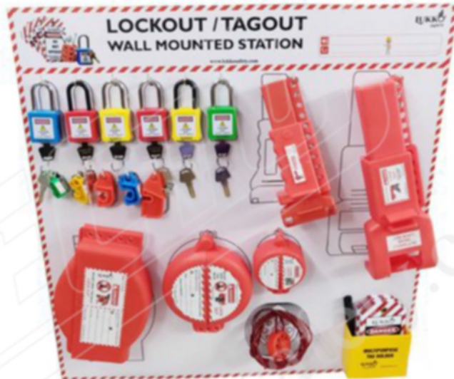
Open Lockout Tagout Station - with material (LS-VK91)