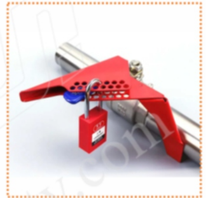
Ball Valve lockout Metallic 1/4" to 1" Small (LS-BA74)