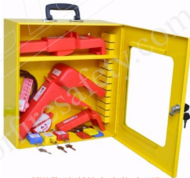
OSHA Electrical & Mechanical Lockout Kit (LS-K34S)