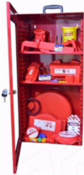
Large Mechanical Lockout Station Kit (LS-K38S)