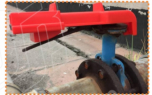
Butterfly Valve 8 to 45mm (LS-BU59)