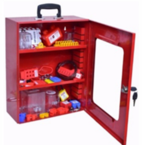
OSHA Electrical Safety Loto Kit With Station (LS-K36S)