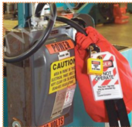
Hanging Plug & Hoist Lockout Cover (LS-PL84)