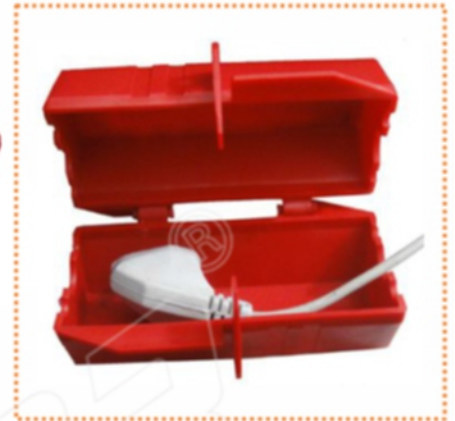
Multi Plug Lockout 2 locking holes (LS-PL79)