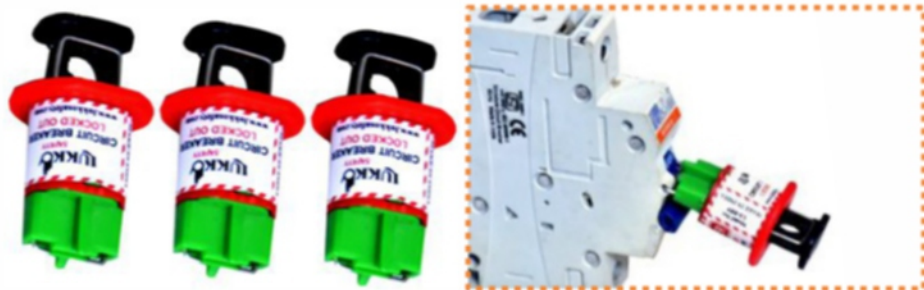
MCB Lockout Pin in Pattern (SET OF 3 PIECES) (LS-BR09)