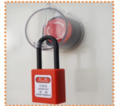
Emergency Push button Round Base (LS-EP69)