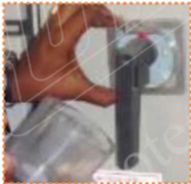
Round Body with Metallic chain (LS-EP54)