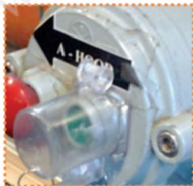
Emergency Push Button Square Cover (LS-EP67)