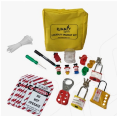
Medium Electro Loto kit (LS-K74)