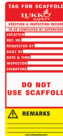
Scaffolding Insertion Tag (LS-T79)