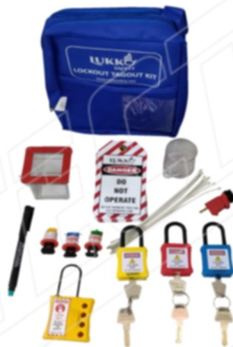
OSHA Basic LOTO Kit (LS-K49)