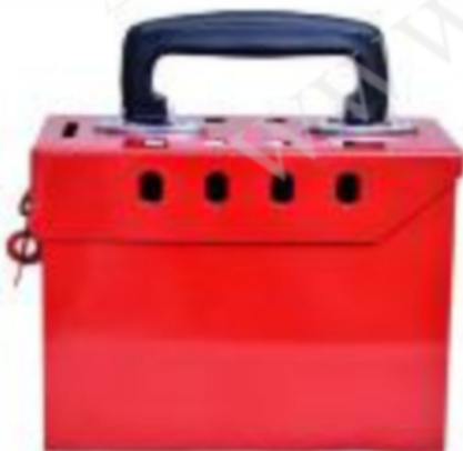
Small Group Lockout Box-8 Holes (LS-G08)