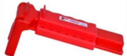
( 50mm to 63.5mm) (single Leg Back Open) (LS-BA67)