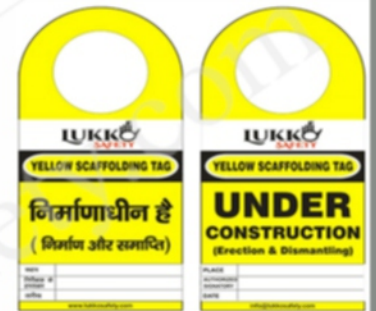
Scaffolding Tag (LS-T72)