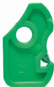
Tiny Pattern (LS-BR24)