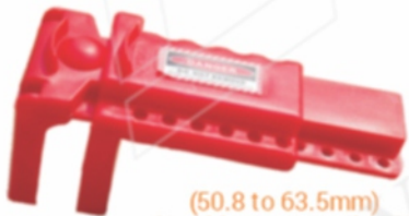
(50.8 to 63.5mm) (Double Leg open back) (LS-BA70)