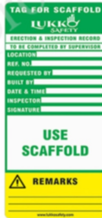
Scaffolding insertion tag (LS-T78)