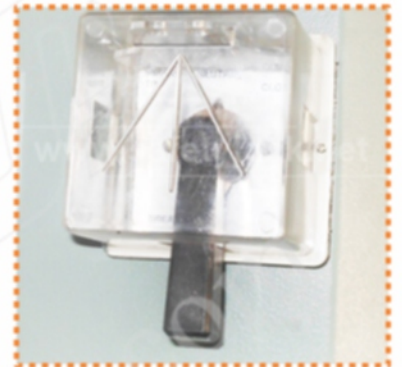
Square Big with 45 degree Cut (LS-EP58)