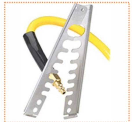
Metallic Pneumatic Lockout (LS-PL91)