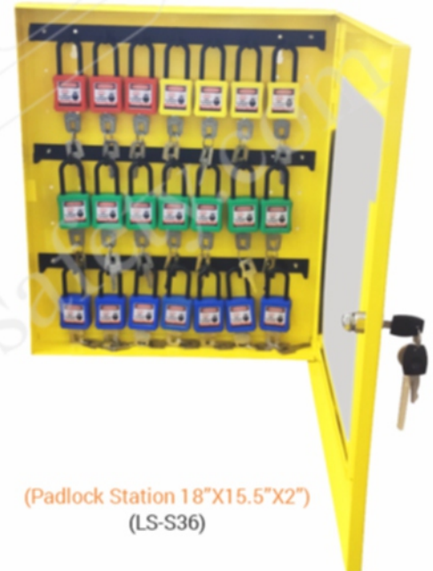
(Padlock Station 18"X15.5"X2") (LS-S36)