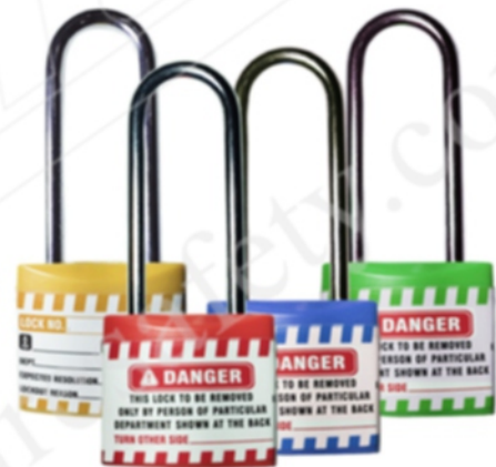
Padlock Regular Shackle 20mm (LS-LC43)