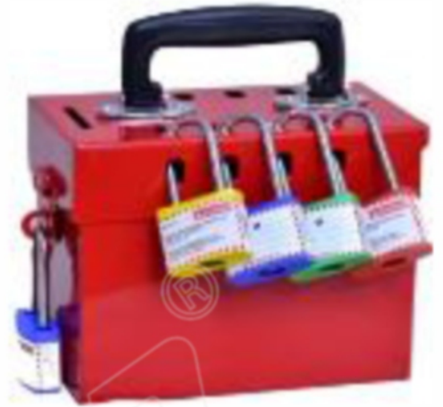
Small Group Lockout Box Kit With Padlock (LS-G11)