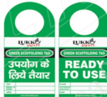
Scaffolding Tag (LS-T73)