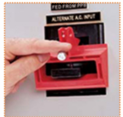
Large Handle Circuit Breaker Lockout With Normal Screw (LS-BR28)