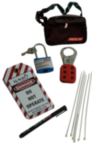
LOTO Common Kit Plus (P202)