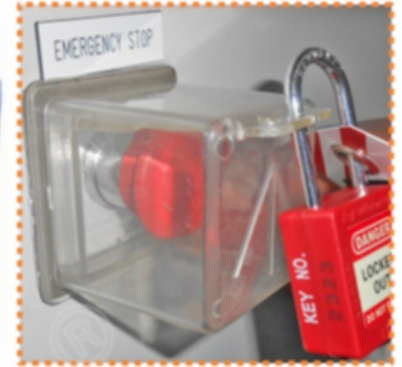
Square Big, 2 locking hole (LS-EP57)