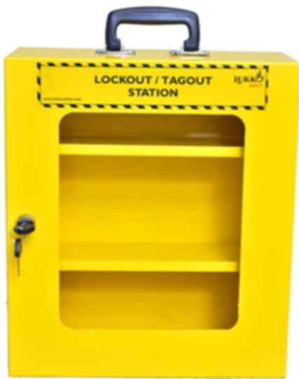
Lockout Station 14"x16"x6" (LS-S42)