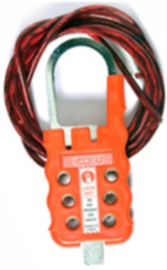
Metallic Multipurpose Cable Lockout (LS-C40)