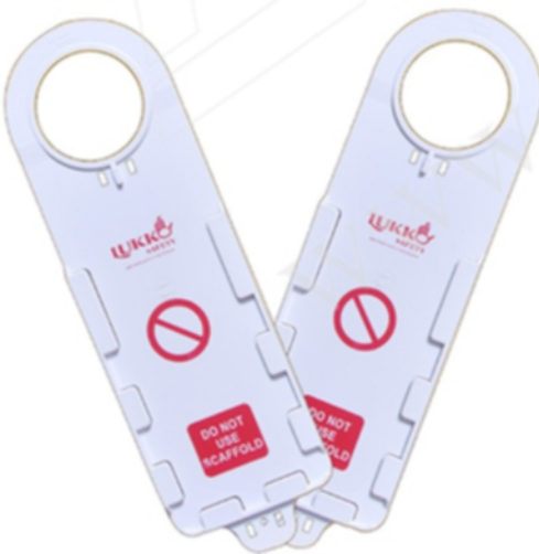
Scaffolding Tag Holder For Tag (LS-T75)