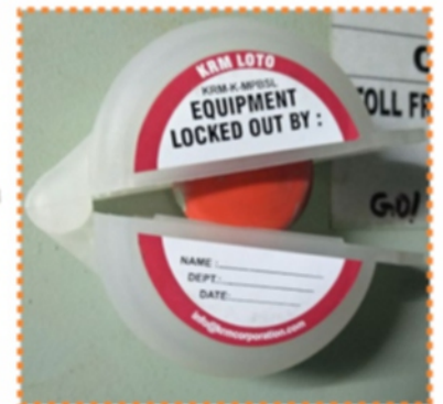
Mushroom Emergency push Button (LS-EP65)