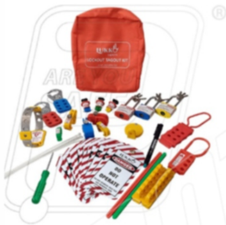
General Contractor LOTO Kit (LS-K67)