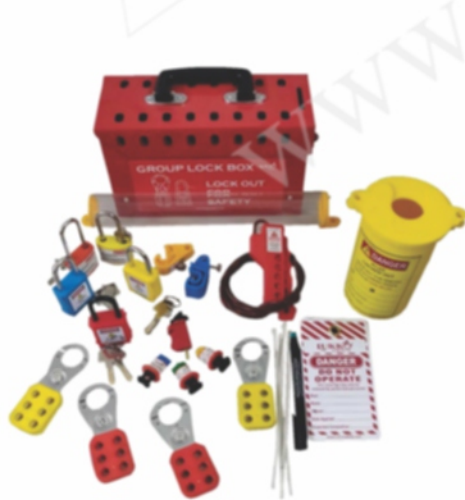
OSHA Group Loto Box Electrical Kit (LS-K53)