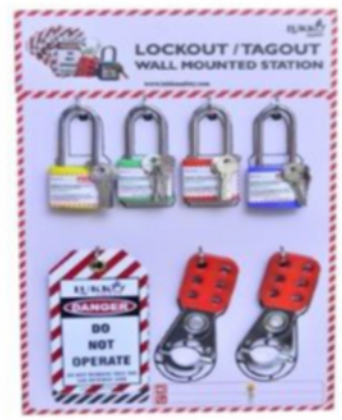
LOTO CENTER / STATION WITH MATERIAL (LS-085)