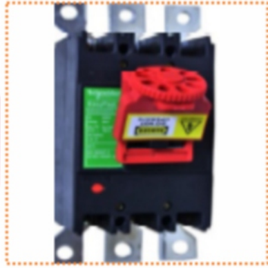
Multi Functional Beaker (LS-BR40)