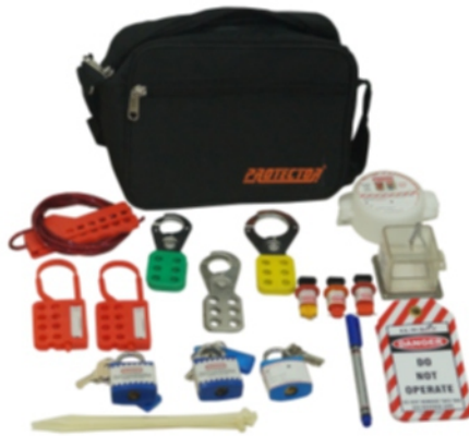
LOTO Safety Personal Kit (P203)