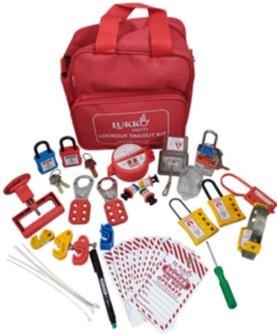
Electrician circuit breaker Pouch Kit (LS-K55)