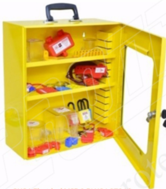
OSHA Electrical MCB & PLUG LOTO Kit (LS-K35S)