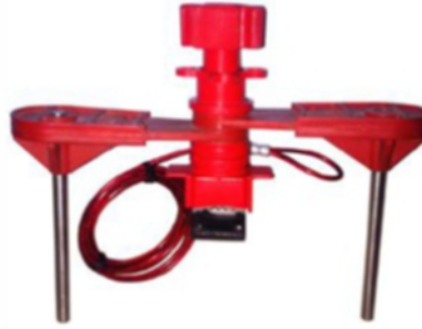
Universal Valve Lockout With Double Small Arm Plus Cable (LS-UV84)