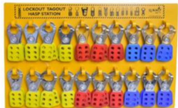
Open Lockout Hasp Station (LS-H78)