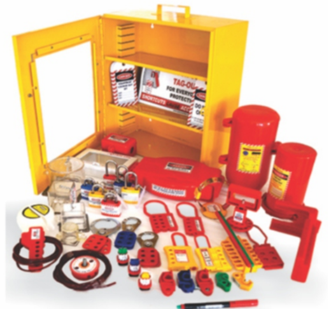
Loto Full Station Kit (P208)