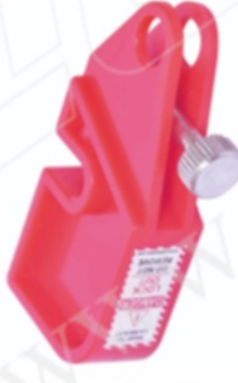
Universal Electrical Fuse Holder Large (LS-BR36)