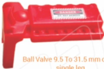
Ball Valve 9.5 To 31.5 mm close single leg (LS-BA66)