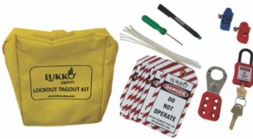
OSHA Maintenance Mini LOTO Kit (LS-K48)