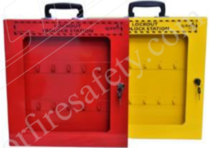
Padlock & Key Lockout Station 15.5" x 2" x 18" (LS-S35)