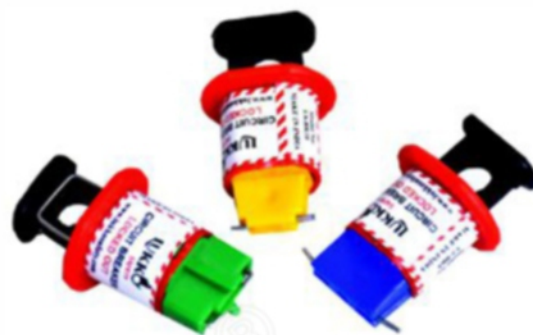
MCB pin in + out + wide (Set of 3 pieces) (LS-BR12)