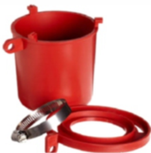
(Plug valve Lockout) (LS-PV62)