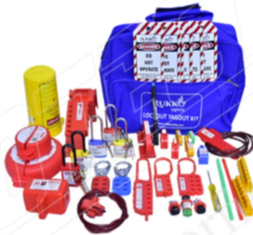
Multi Purpose LOTO kit (LS-K45)