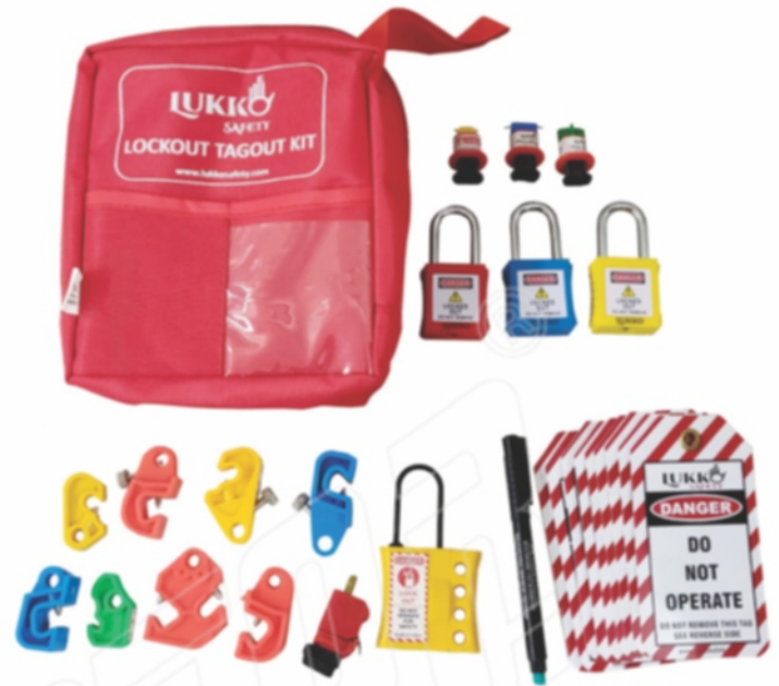
OSHA Medium Electric Circuit Breaker Pouch Kit (LS-K70)