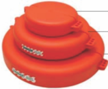
(63.5 to 127mm) (LS-G53)