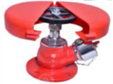
(254 to 355mm) (LS-G57)