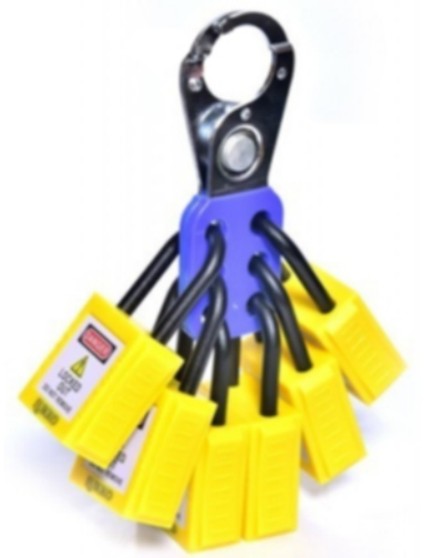
Lockout Padlock Hasp Kit (LS-H73)