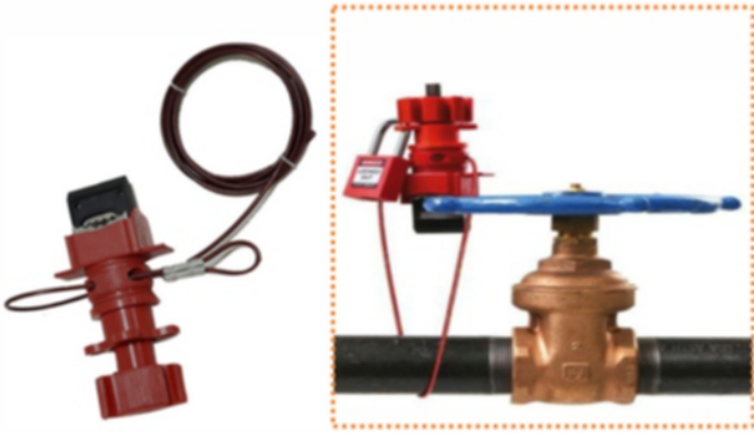
Universal Valve Lockout With Insulated Cable (LS-UV77)