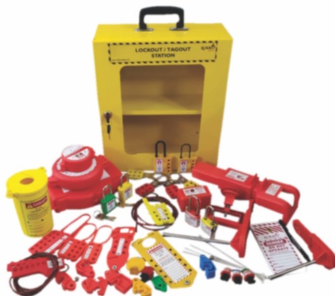
Safety Valve And Electrical Lockout Kit (LS-K50)