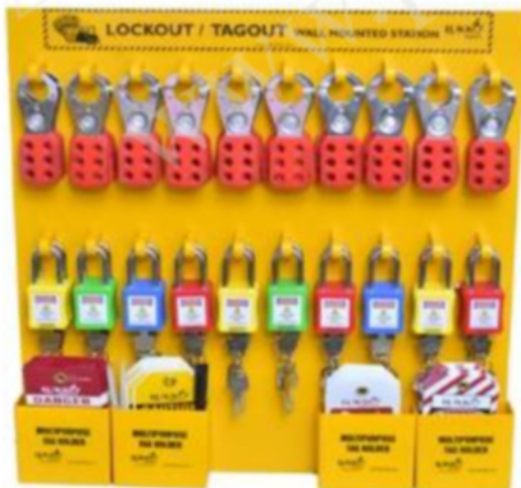
Open Lockout Padlock, Hasp & Tags Station (LS-055)