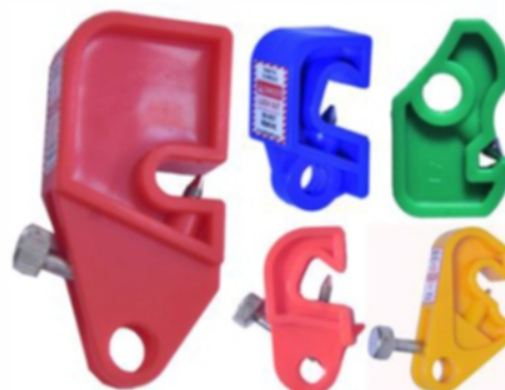
Br38 Set Of 5 (LS-BR16,20,22,24,36)