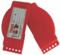
Adjustable Gate Valve Device (25 To 165mm) (LS-G55)