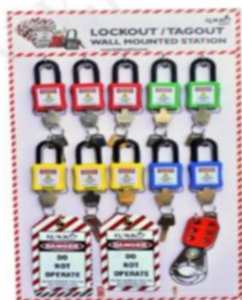
CUSTOMISED SHADOW BOARDS WITH MATERIAL (LS-090)