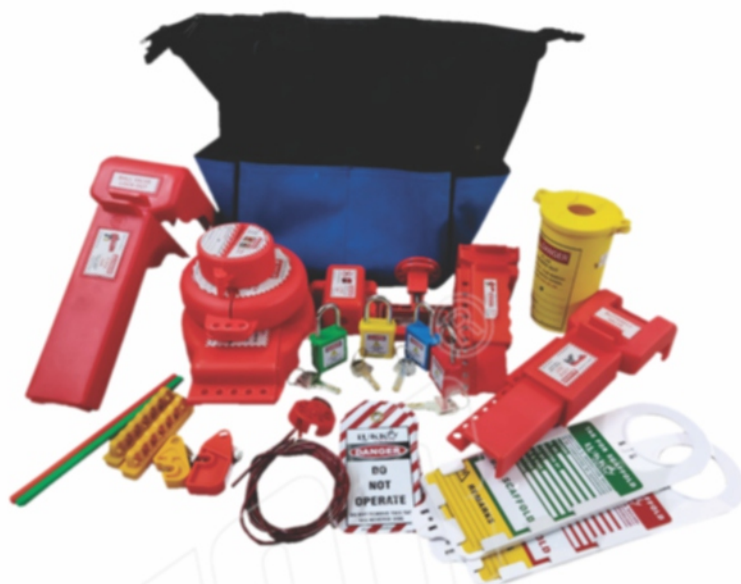
OSHA Electrical Power & Panel Kit (LS-K43B)