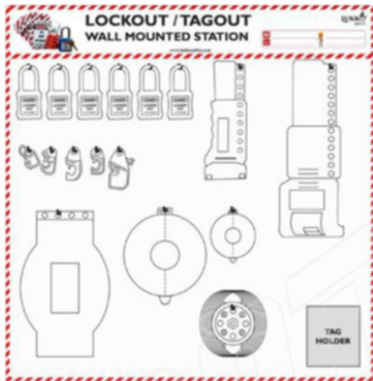
Open Lockout Tagout Station - without material (LS-VK90)