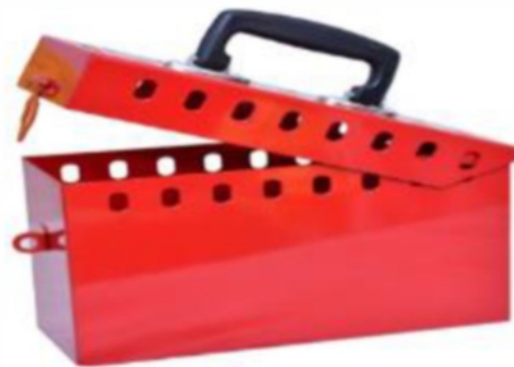
Medium Group Lockout Box-16 Holes (LS-G12)