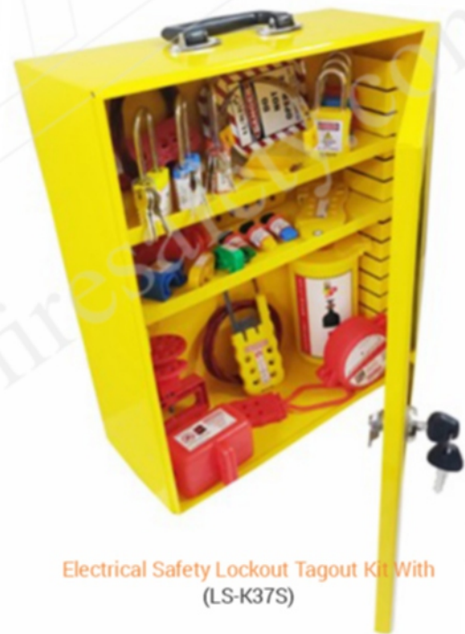
Electrical Safety Lockout Tagout Kit With (LS-K37S)