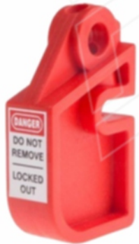
Universal Electrical Fuse Holder Small (LS-BR34)