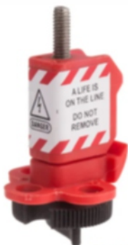
MCB Lockout tie bar Pattern (LS-BR13)