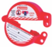
(25 to 63.5mm) (LS-G52)