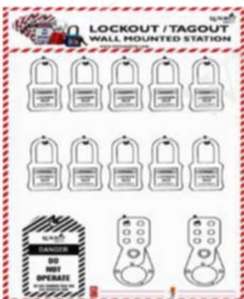
CUSTOMISED SHADOW BOARDS (LS-088)