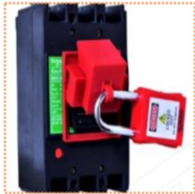
Snap on Circuit Breaker Medium (LS-BR41)