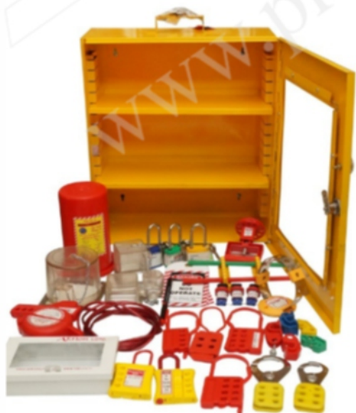
LOTO Electrical Power & Panel Kit (LS-P206)