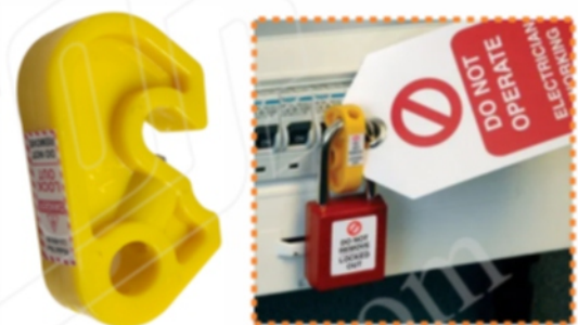
MCB Curvature Shape Small (LS-BR19)