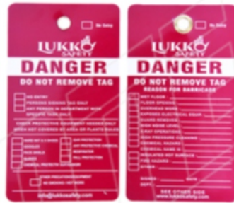
Danger Do Not Remove (LS-T51)