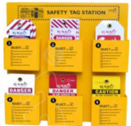
Safety Tag Station 14" x 14" (LS-T91)