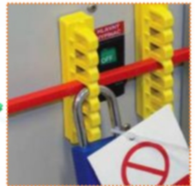
Group Circuit Breaker (LS-BR27)