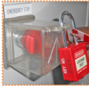
Square Small, 2 locking hole (LS-EP51)