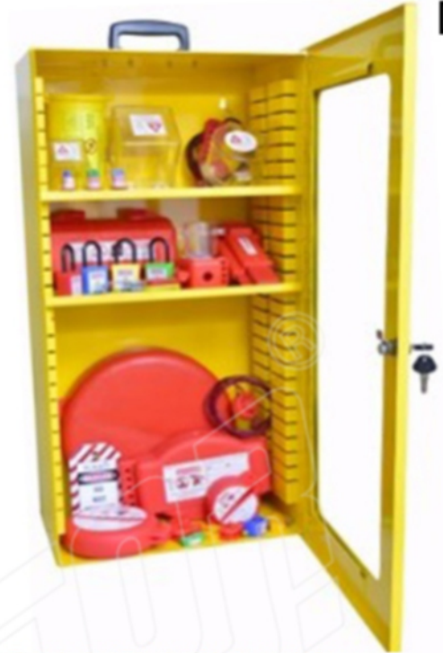
Electrical LOTO Kit With OSHA Safety Lock (LS-K40S)