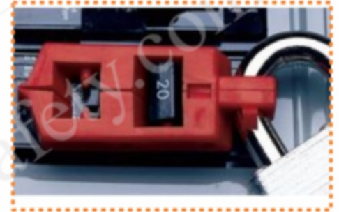
Snap On Circuit Breaker Lockout (LS-BR32)