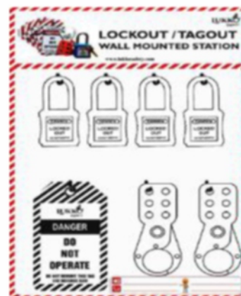
LOTO CENTER / STATION (LS-084)