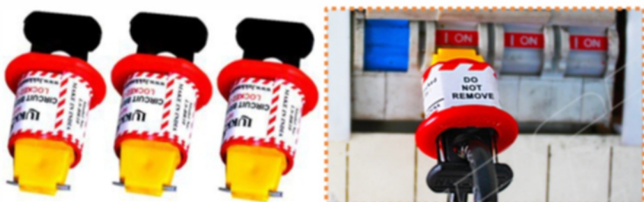
MCB Lockout Pin Out Pattern (SET OF 3 PIECES) (LS-BR10)