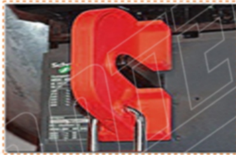
Large Circuit Breaker (LS-BR33)