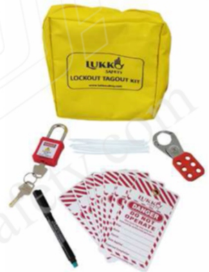
OSHA Medium Electro Kit (LS-K69)