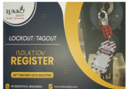
Lockout Tagout Register (LS-R111)