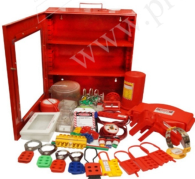
LOTO Plant & Machinery Kit (P207)