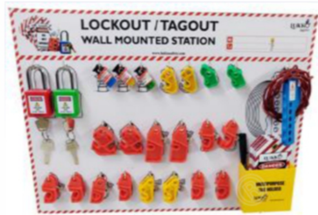
Open Lockout Tagout Station - with material (LS-BR51)