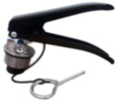
Valve for ABC type fire extinguisher 5 kg/ 10 kg (5294)