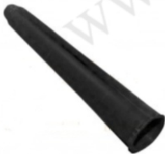
Discharge horn for CO2 2 & 3 kg (5234)