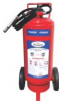
ABC 25 Kg Trolley Mounted Safety Fire (5307)