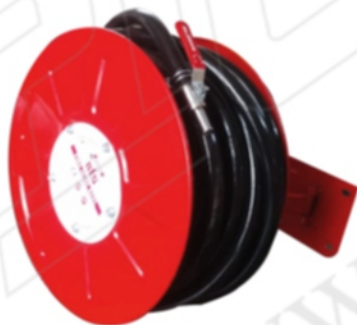
Fire Hose Reel Swivelling Type with Pipe & Nozzle (5128)