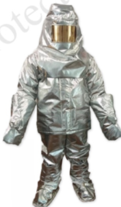
Aluminised fire entry suit 7 layer (7764)