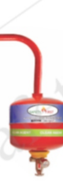
Clean Agent 2kg. Safety First (5051)