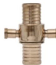
M/F Coupling 63mm Gun matel . (5114)