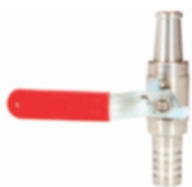
Fire Hose PVC Pipe Shut off Nozzle 25mm (5123)