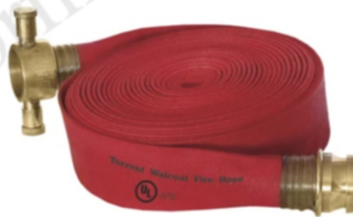
63mm X 15M Torrent Walcoat Type 2 With IS 304 Coupling (5468)