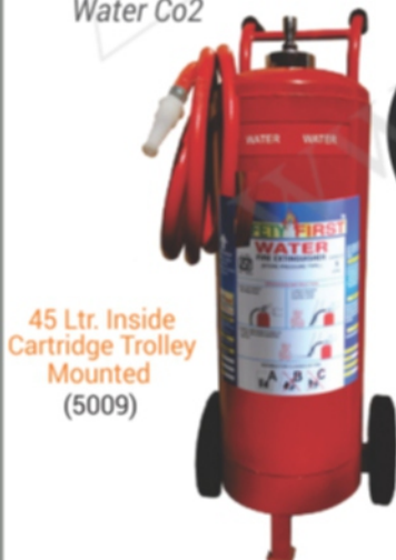
45 Ltr. Inside Cartridge Trolley Mounted (5009)