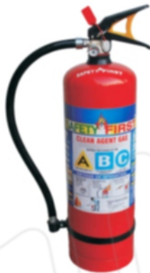
4 kg Safety First (5053)