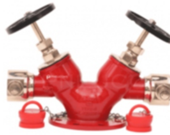
Landing Valve Double G.M. (5106/G)