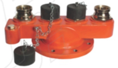
Fire Hydrant Four Way Inlet Breeching Valve S.S. (5162/SS)