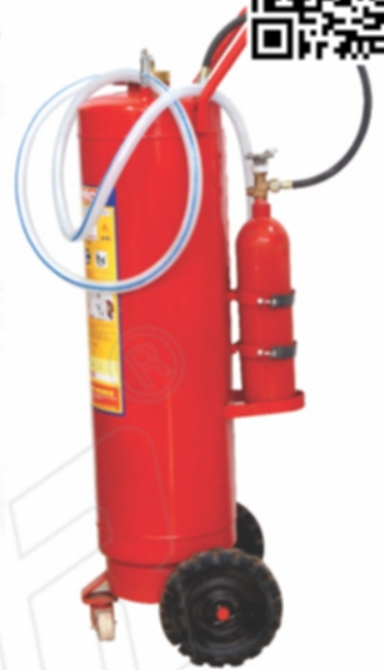
75 kg Outside CO2 Bottle Trolley Mounted Safety First (5038)