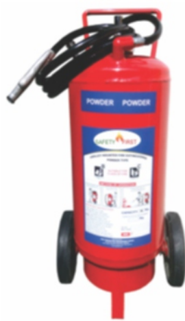
25 kg Inside Cartridge Trolley Mounted Safety First (5040)