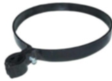
Belt for ABC type fire extinguisher (5261)