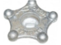
Aluminium wheel for CO2 fire extinguisher (5284)