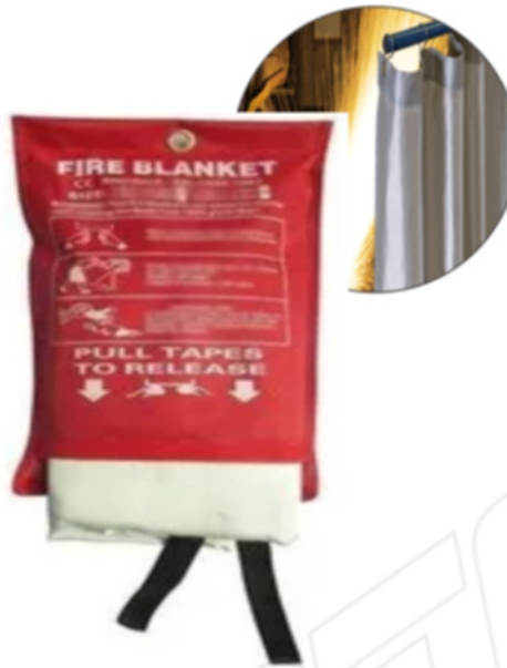
Fire blanket 1M X 2M X 0.55mm(2311) 2M X 2M X 0.55mm(2305)