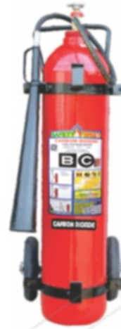
6.5 kg Safety Fire (5024)