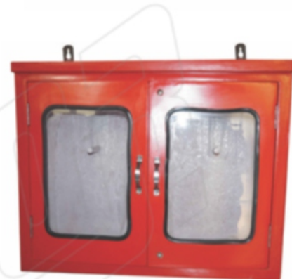
Fire Hose Box Double Door MS (5120)