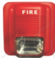
Fire Alarm/ Strobe /Hooter (5141)