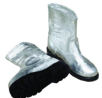
Aluminized Safety Boot (7751)