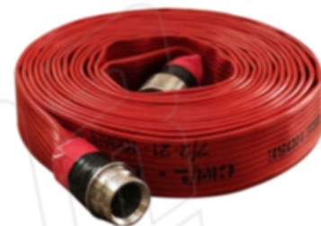
63mm X 15M RRL-B/Type 3 With Coupling