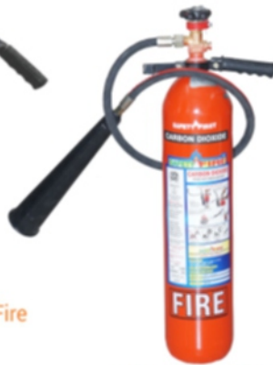
4.5 kg Safety Fire (5301)