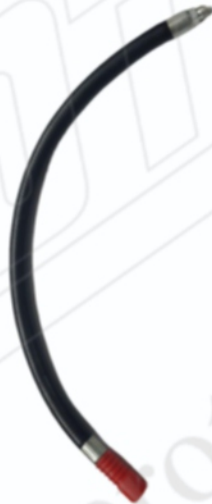
Discharge hose for ABC/DCP Type 9 kg (5205)