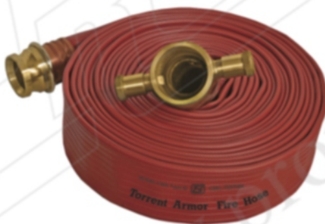
63mm X 15M Torrent Armor Type 3 With IS 304 Coupling (5467)