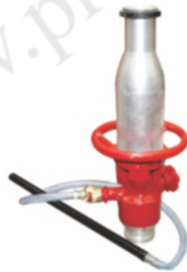
Foam Making Branch Pipe FB 5X (5072)