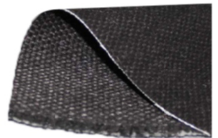
Graphite Coated Welding Blanket 1MX2MX0.9 mm (2318)