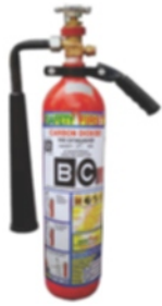
2 kg Safety Fire (5021)