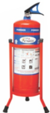
ABC/ DCP 9 kg M.S. Stand (5175)