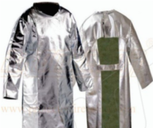
Aluminized Fire Apron With Sleeve (780/36)