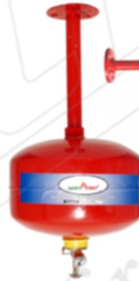
Automatic Modular ABC 5 kg. Safety First (5067)