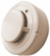
Smoke Detector (5142)