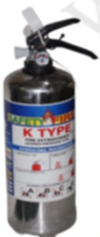
2,4 & 6 kg Safety First (KSS2, KSS4 & KSS6)