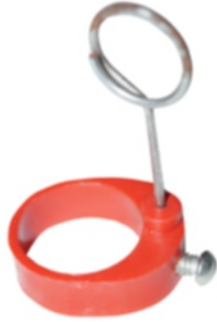
Co2 safety seal with M S pin (5273)