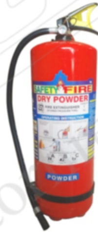
4 kg Safety Fire (5303)