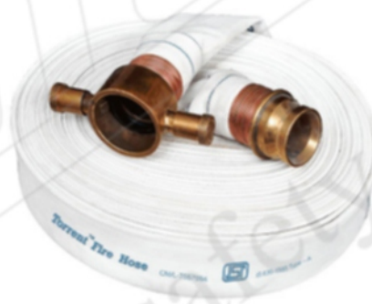
63mm X 15M Torrent UL Listed With IS 304 Coupling (5481)