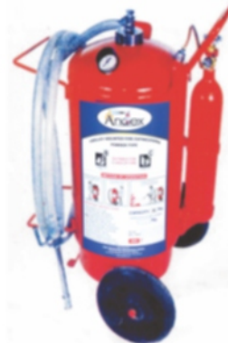
ABC 50 Kg Trolley Mounted Safety Fire (5320)