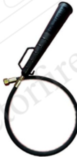
Discharge hose 1 M with horn for 4.5/6.8 kg CO2 fire extinguisher (5282)