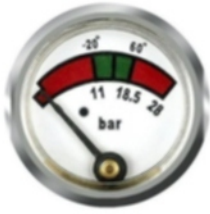
Fire extinguisher ABC pressure gauge (5286)