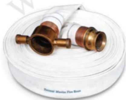
63mm X 15M Torrent Maxima Type A With IS 304 Coupling (5472)