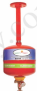
Clean Agent 4 kg. Safety First (5056)