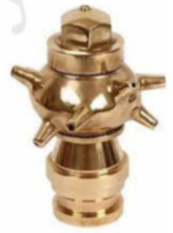
Fire fighting Revolving Nozzle 63mm (5136)