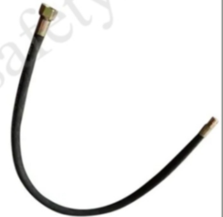
Discharge hose for CO2 1 M (5221/1)