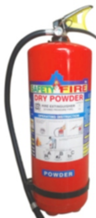
9 Kg S.P. Safety Fire (4934)