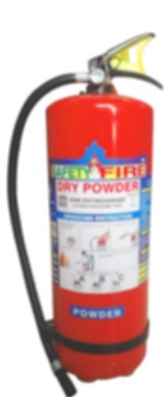
6 Kg S.P. Safety Fire (5031)