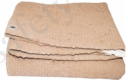
Fire Blanket / Welding Vermiculite Coated Ceramic 2M X 2M X 3.2MM(2314/2)