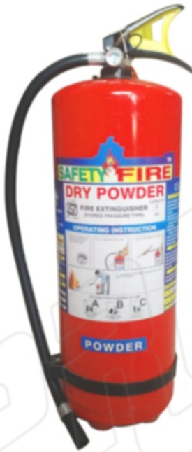
9 kg Safety Fire (5305)