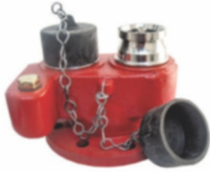
Fire Hydrant Two Way Inlet Breeching Valve S.S. (5166)