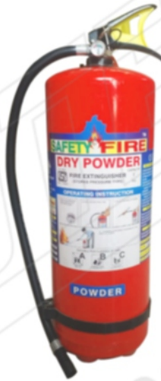
6 kg Safety Fire (5304)