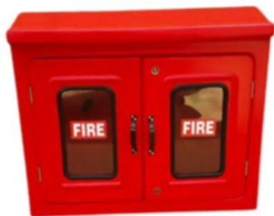
FRP Box 600X 750X 300mm For Co2 4.5 Kg & ABC 6 Kg (5180)