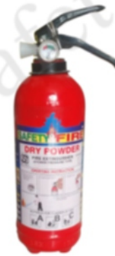
2 kg Safety Fire (5309)