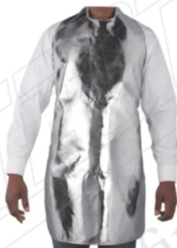
Aluminized Aramid Apron (7858)