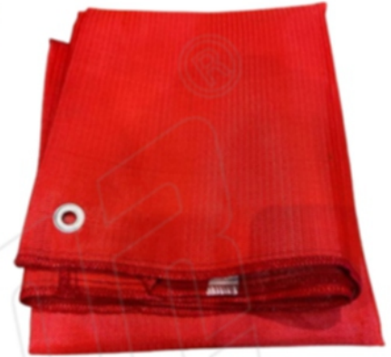
Fire Blanket Coated 1M X 2 M X 0.6mm(2308) 2M X 2M X 0.6MM(2309)