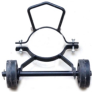
Trolley Wheel for 9 kg Co2 Fire (5226)