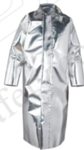
Aluminized Aramid Full Coat (7762) 2 Layer (7763) 3 Layer