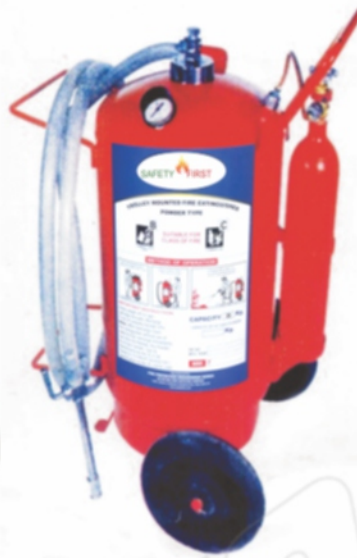
50 kg Outside Co2 Bottle Trolley Mounted Safety First (5029)