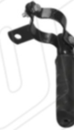
Carrying neck handle for CO2 4.5 kg (5271)