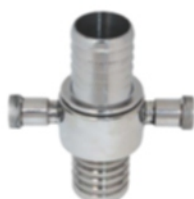
M/F Coupling 63mm S.S.304 (5117) S.S 204(5117/2)