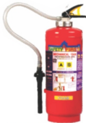
9 Ltr. Stored Pressure Safety First (5042)