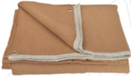
Fire Blanket / Welding Vermiculite Coated Ceramic 1M X 2M X 2.2mm(2312) 2M X 2M X 2.2mm(2313)