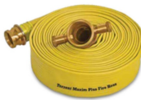
63mm X 15M Torrent Maxima Plus Type 1 With IS 304 Coupling (5474)