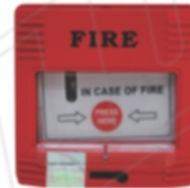
Fire Manual Call Point (5144)