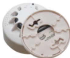
Smoke Detector Cordless (5148)