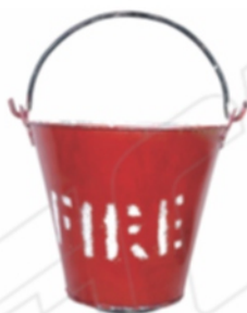
Fire Bucket 9 Liters (5101)