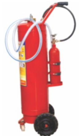
ABC 75 Kg Trolley Mounted Safety Fire (5321)