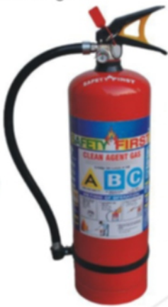
6 kg Safety First (5063)