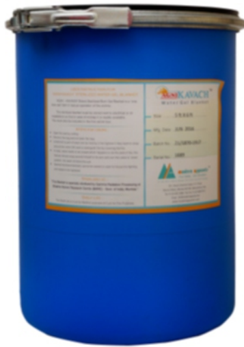
Water Gel Blanket 5 FT X 6 FT (2301) 5 FT X 8 FT (2302) 6 FT X 8 FT (2303)