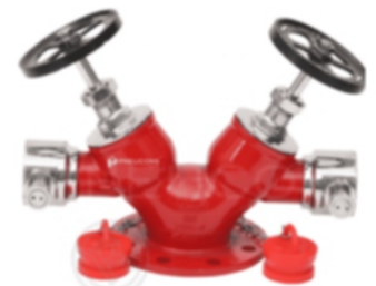
Landing Valve Double S.S. (5106/SS)