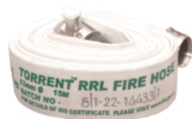
63mm X 15M RRL-A/ Type 1 With Coupling