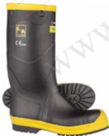
Fire Fighter Boot (7741)