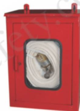
Fire Hose Box Single Door MS (5119)