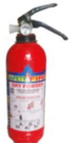
1 kg Safety Fire (5310)