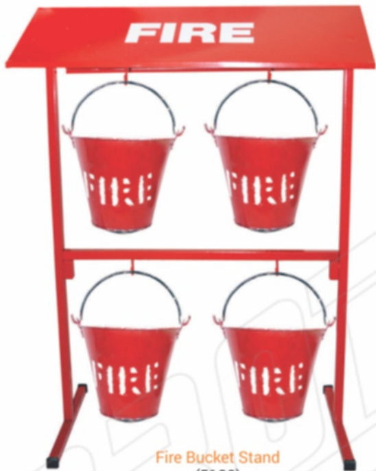
Fire Bucket Stand (5100)