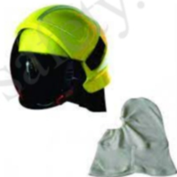
Fire Fighter Helmet with Balaclava hood (7743)