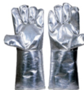
Aluminized Gloves Protector 2Layer (7748) 3Layer (7745) 4 Layer (7744)