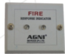
Fire Alarm Response Indicator (5143)