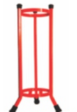
ABC/DCP 4 kg M.S. Stand (5172)