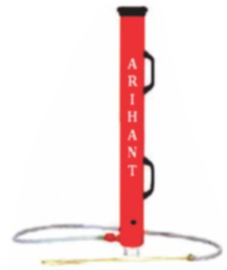
Foam Making Branch Pipe FB 2X (5071)