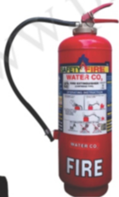
9 Ltr. Stored Pressure Safety Fire (5014)