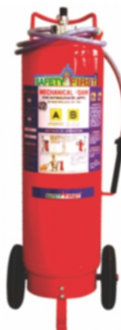
45 Ltr. Inside Cartridge Trolley Mounted (4942)