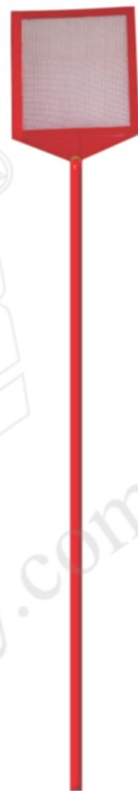
Fire Beater (5302)