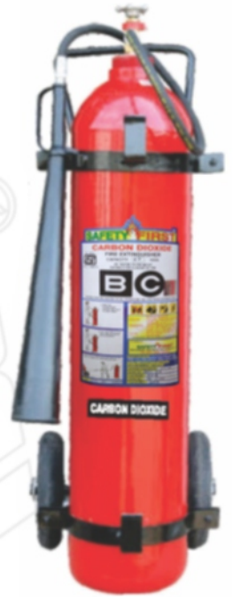
Trolley Mounted 22.5 kg Safety Fire (5026)