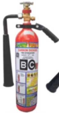
3 kg Safety Fire (5022)