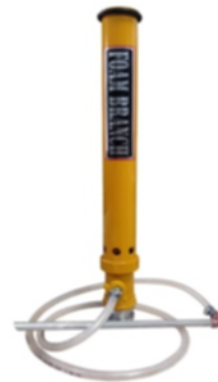
Foam making branch pipe FB 10X (5073)