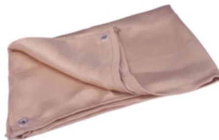
Silica welding blanket 1mX2MX0.5m (2315)