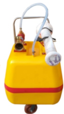
Mobile Foam Trolley 100, 150 & 200 Liters (MFT)