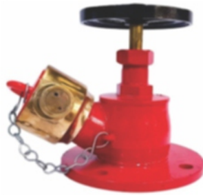
Fire Hydrant Landing Valve Single G.M. (5182)