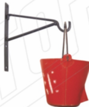
Wall Bracket For Hanging Fire Bucket (5099)