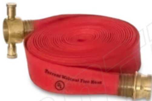
63mm X 15M Torrent Walcoat UL Listed With IS 304 Coupling (5469)