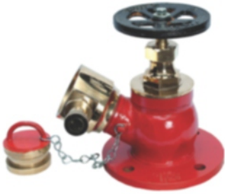
Landing Valve Single S.S. (5105)