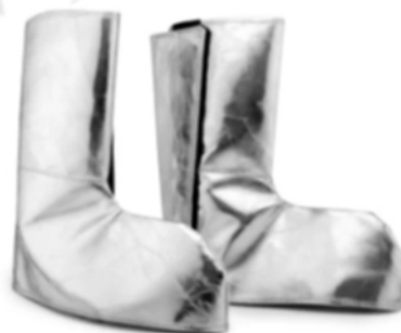
Aluminized Aramid Leg Guard 16" Alumaster (7736)