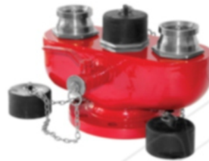
Fire Hydrant Three Way Inlet Breeching Valve S.S. (5106/SS)