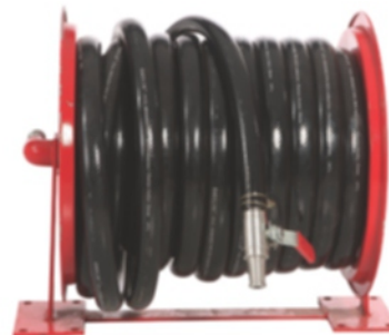
Fire Hose Reel With Pipe & Nozzle (5125)