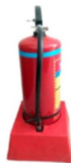
FRP floor stand (5171)