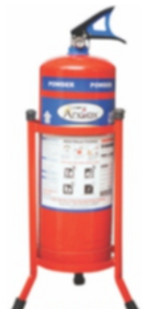
ABC/ DCP 6 kg M.S. Stand (5173)