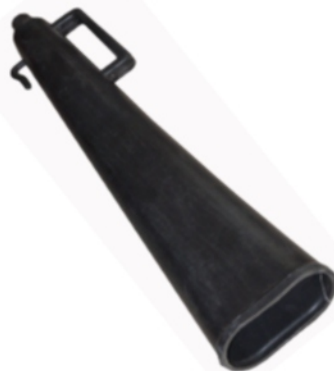
Discharge horn for 4.5/6.8 kg CO2 fire extinguisher (5234)