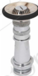
Nozzle Triple Purpose Universal Gun Metal (5131)