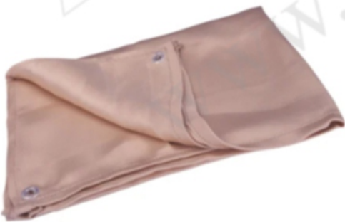
High silica welding blanket 1mX2MX0.8mm (2315)