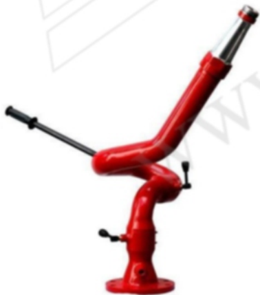
Water cum foam monitor 63mm (5082)