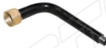
Band for 2 & 3 kg CO2 fire ext. (5231)