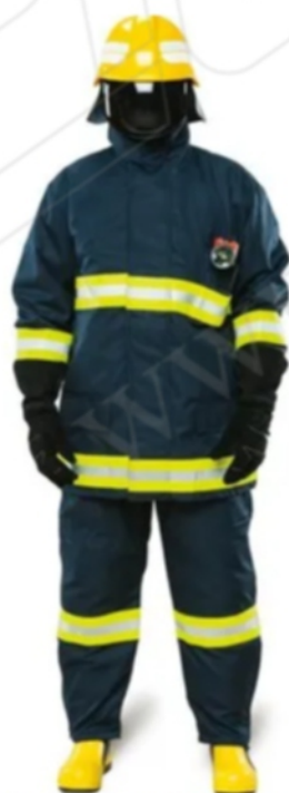
Fire Proximity Nomex Suit (Turnout gear) (NFS-101)