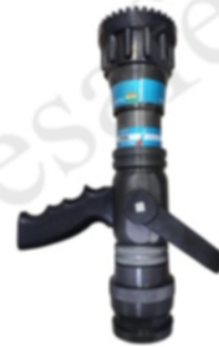
Multi Purpose Spray Jet Nozzle 63 mm (5135)