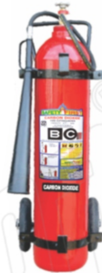
Trolley Mounted 9 kg Safety Fire (5025)