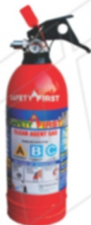
2 kg Safety First (5059)