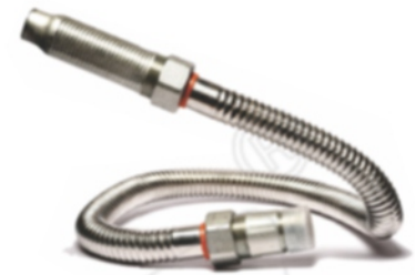
Flexible Sprinkler Drop 1.5 Meter (PFHUB) (1.5)