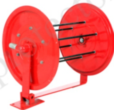
Fire Hose Reel For 30 Mtr. PVC Pipe (5121)