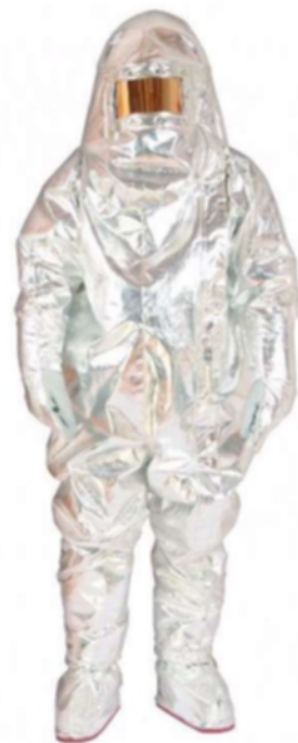
Aluminised Molten Metal Suit 3 Layer ALUMASTER (7747)