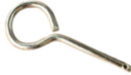
M.S safety pin for ABC type fire extinguisher (5281)